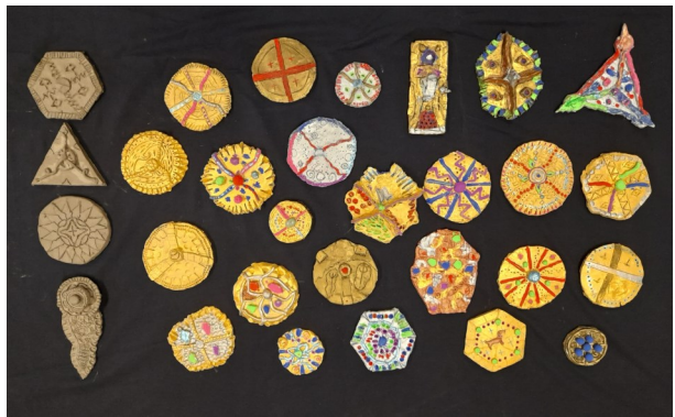
Cross curricular work around the school