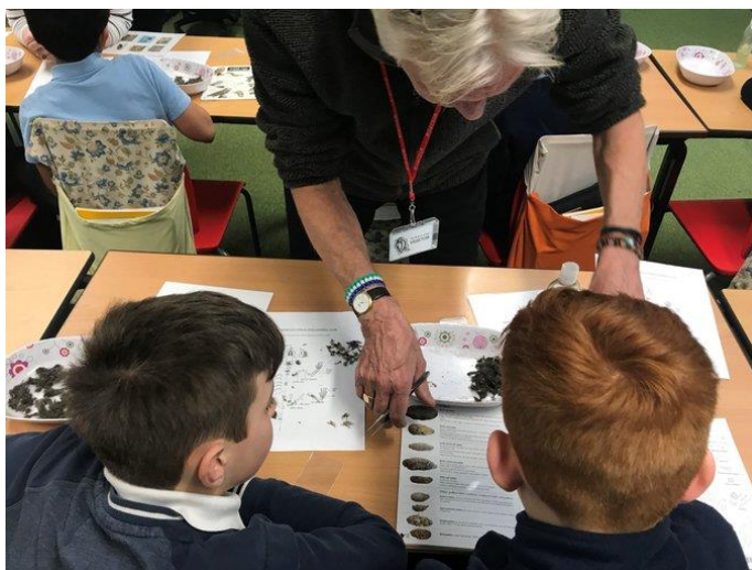
Examining owl pellets made at Science Club