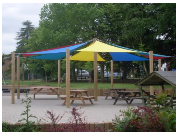
Shade Sail and Rainbow benches for the children funded by FABS