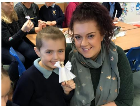
Christmas Decoration Day in Year 1

We will host a number of extra events over the course of the year to engage children in their learning and parents too. These may include International week, themed dressing up days, author visits, storytelling and Mother's/ Father's Day breakfasts.