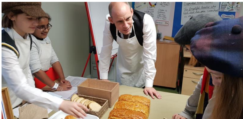
A World War II Day in Year 6

Who were the Mayans? How did the Egyptians build their pyramids? What did the Romans (ever) do for us? Why did Shackleton's Antarctic expedition fail so heroically? Who?, What?, Where?, When?, How? and most importantly, Why?, are the questions that drive our history curriculum. Through such a spirit of enquiry, the children will develop a sense of chronology, an understanding of the causes and consequences of events, the similarities and differences between historical periods and the role of the individual in forming the past. Visitors in, trips out, artefacts and a huge range of sources will help to spark the children's curiosity by bringing life to events from centuries past.