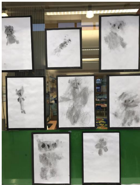
Observational drawings by Reception children using charcoal

During the preceding Summer Term, there are several opportunities for pre-school children to visit the School. There is time for parents to come into school to meet the staff and to be given an information pack concerning the school and the curriculum. Every child is offered visits to school before they start school, where their class teacher comes to meet them.