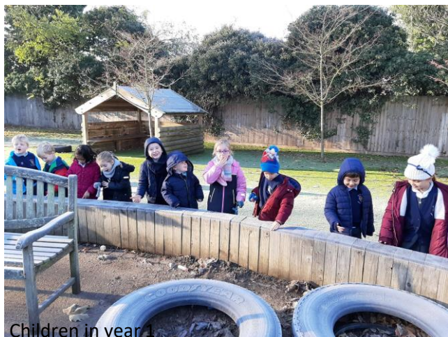
Children in year 1 investigating seasonal changes

Spending time outdoors in the natural world has huge benefits for children's physical and mental health. At The Bellbird, we recognise these advantages and are committed to giving children access to a range of exciting outdoor learning activities. The Bellbird Primary School is fortunate to have a