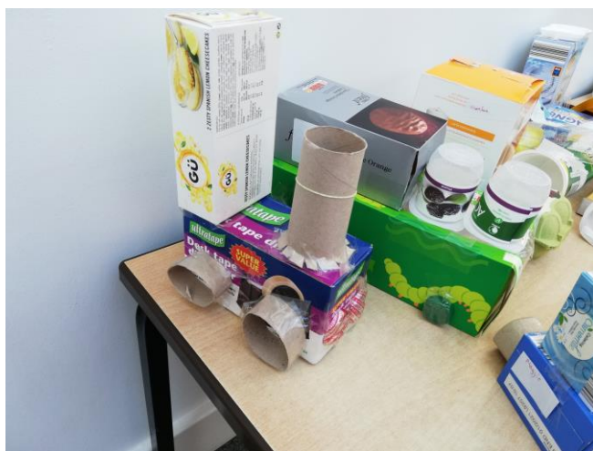
Tractors made using a range of materials from the recycling box