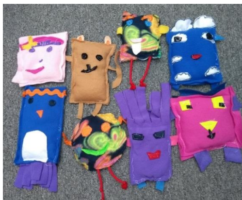
Funky wheat bags made at sewing club

We offer a variety of school clubs and groups which meet in and out of school hours. The school's policy is to encourage as much involvement from the children and interested parents as possible. These clubs range from sport based activities; tennis, dodgeball, multi-sports, to art based ones such as knitting club, drama club and coding club.