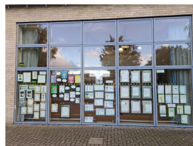
Children's work displayed at the front of school.