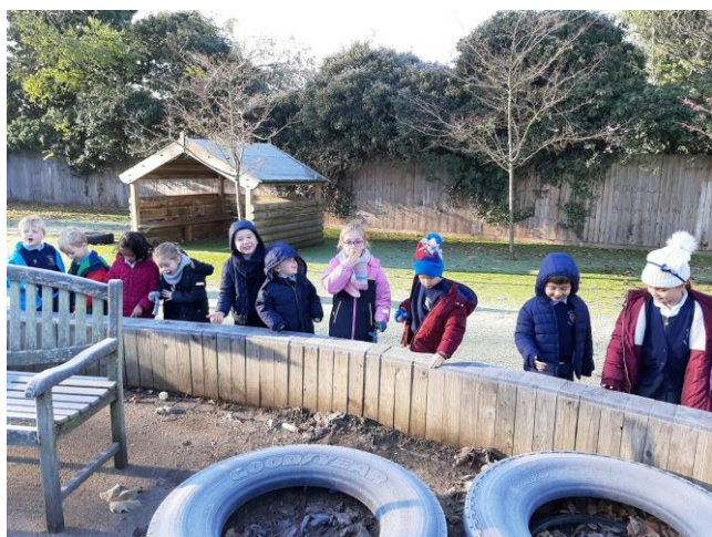
Children in year 1 investigating seasonal changes

Spending time outdoors in the natural world has huge benefits for children's physical and mental health. At The Bellbird, we recognise these advantages and are committed to giving children access to a range of exciting outdoor learning activities. The Bellbird Primary School is fortunate to have a large outdoor area containing a range of different habitats, and we are focusing on developing learning opportunities for children in these grounds. We are fortunate to have purchased a class set of cooking stoves which multiple year groups use to positive effect with their classes. As one of our pupils recently said about their own learning, "Being outside makes it an adventure."