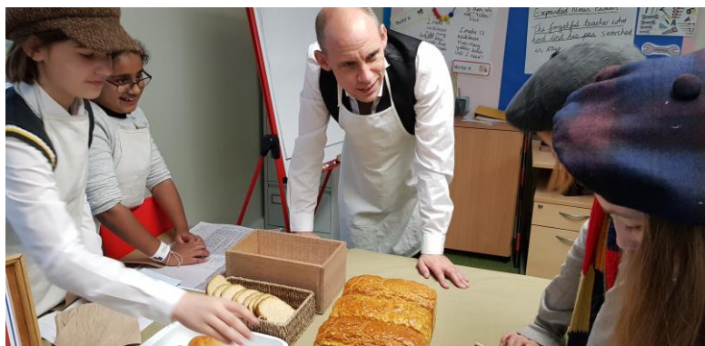
A World War II Day in Year 6

Who were the Mayans? How did the Egyptians build their pyramids? What did the Romans (ever) do for us? Why did Shackleton's Antarctic expedition fail so heroically? Who?, What?, Where?, When?, How? and most importantly, Why?, are the questions that drive our history curriculum. Through such a spirit of enquiry, the children will develop a sense of chronology, an understanding of the causes and consequences of events, the similarities and differences between historical periods and the role of the individual in forming the past. Visitors in, trips out, artefacts and a huge range of sources will help to spark the children's curiosity by bringing life to events from centuries past.