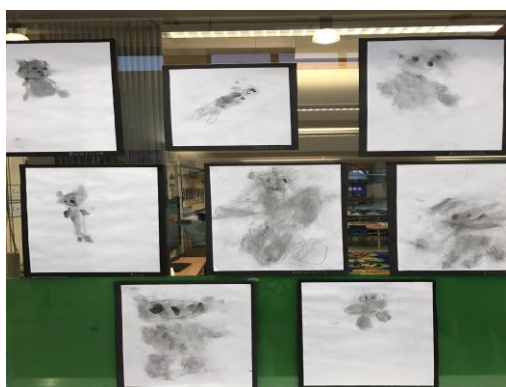
Observational drawings by Reception

Once a place has been confirmed by our admissions team information will be sent regarding transition events. During the Summer Term prior to admission, there are several opportunities for pre-school children to visit the school and meet the team. There is time for parents to come into school to find out more about the reception year and what they can to prepare their child for the transition. The reception year starts with a reduced timetable to ensure the children have time to settle to the new routine.