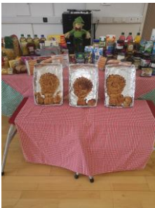
Bread made at gardening club and shared in our harvest assembly.

We offer a variety of school clubs and groups that meet in and out of school hours. The school's policy is to encourage as much involvement from the children and interested parents as possible. These clubs range from sport based activities; tennis, dodgeball, multi-sports, to art based ones such as knitting club, drama club and coding club. Cost should not be a barrier to attendance and we encourage families to request a meeting with the heads should this be a concern for any family for a club or trip.