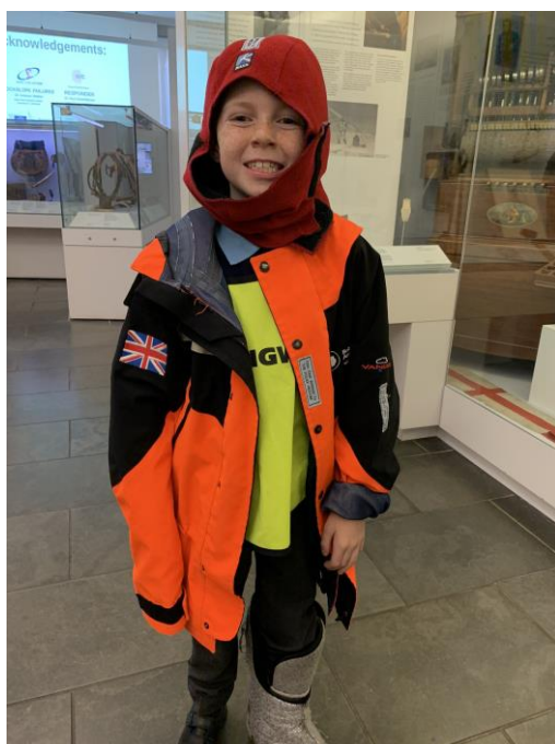
Year 5 visit the Polar Museum at the Scott Polar Research Institute in Cambridge

In Geography at The Bellbird, we aim to equip children with a wider understanding of different locations around the world and how they compare and contrast with each other. Children learn about how humans interact with their environment and the impact they have on the areas in which they live and on the wider world. They also learn about the physical geography of the Earth and vocabulary associated with its different features. Children develop their ability to interpret different sources of information including compasses, maps, photographs and graphs.