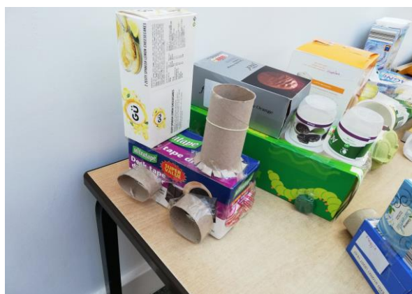
Tractors made using a range of materials from the recycling box