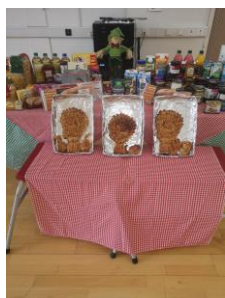
Bread made at gardening club and shared in our harvest assembly.

We offer a variety of school clubs and groups that meet in and out of school hours. The school's policy is to encourage as much involvement from the children and interested parents as possible. These clubs range from sport based activities; tennis, dodgeball, multi-sports, to art based ones such as knitting club, drama club and coding club. Cost should not be a barrier to attendance and we encourage families to request a meeting with the heads should this be a concern for any family for a club or trip.