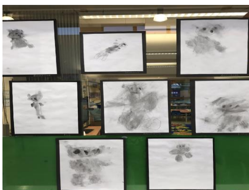
Observational drawings by Reception

Once a place has been confirmed by our admissions team information will be sent regarding transition events. During the Summer Term prior to admission, there are several opportunities for pre-school children to visit the school and meet the team. There is time for parents to come into school to find out more about the reception year and what they can to prepare their child for the transition. The reception year starts with a reduced timetable to ensure the children have time to settle to the new routine.