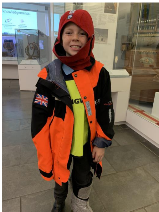
Year 5 visit the Polar Museum at the Scott Polar Research Institute in Cambridge

In Geography at The Bellbird, we aim to equip children with a wider understanding of different locations around the world and how they compare and contrast with each other. Children learn about how humans interact with their environment and the impact they have on the areas in which they live and on the wider world. They also learn about the physical geography of the Earth and vocabulary associated with its different features. Children develop their ability to interpret different sources of information including compasses, maps, photographs and graphs.