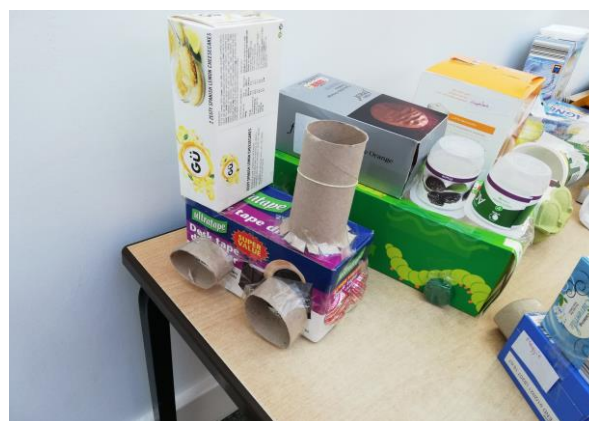
Tractors made using a range of materials from the recycling box